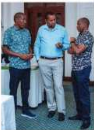
Chief of Staff and Head of Public Service Delivery (center) with KEMSA staff members.

In addition, the Chief of Staff pledged his personal Executive Office's support to facilitate timely payments from the County of Governors and other similar government entities. The goal is to fast-track the processing of outstanding payments owed to KEMSA and ensure that timely payments are made going forward. This injection of capital will provide the organization with much-needed liquidity to continue its operations effectively. KEMSA also plans to enter into Service Level Agreements with all counties in order to foster engagement and create a more structured