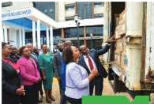
KEMSA reviewing bids to the supply board.

Furthermore, the Board is conducting an in-depth review of ongoing contracts that were processed through single sourcing and monopsony practices. Supply systems identified that any contracts found to be lacking in value for money will be transferred to the Public Procurement Regulatory Authority (PPRA) and the Ethics and Anti-Corruption Commission (EACC) for investigation. The commitment to sustainability underpins KEMSA's initiatives to eradicate corruption and malpractices.