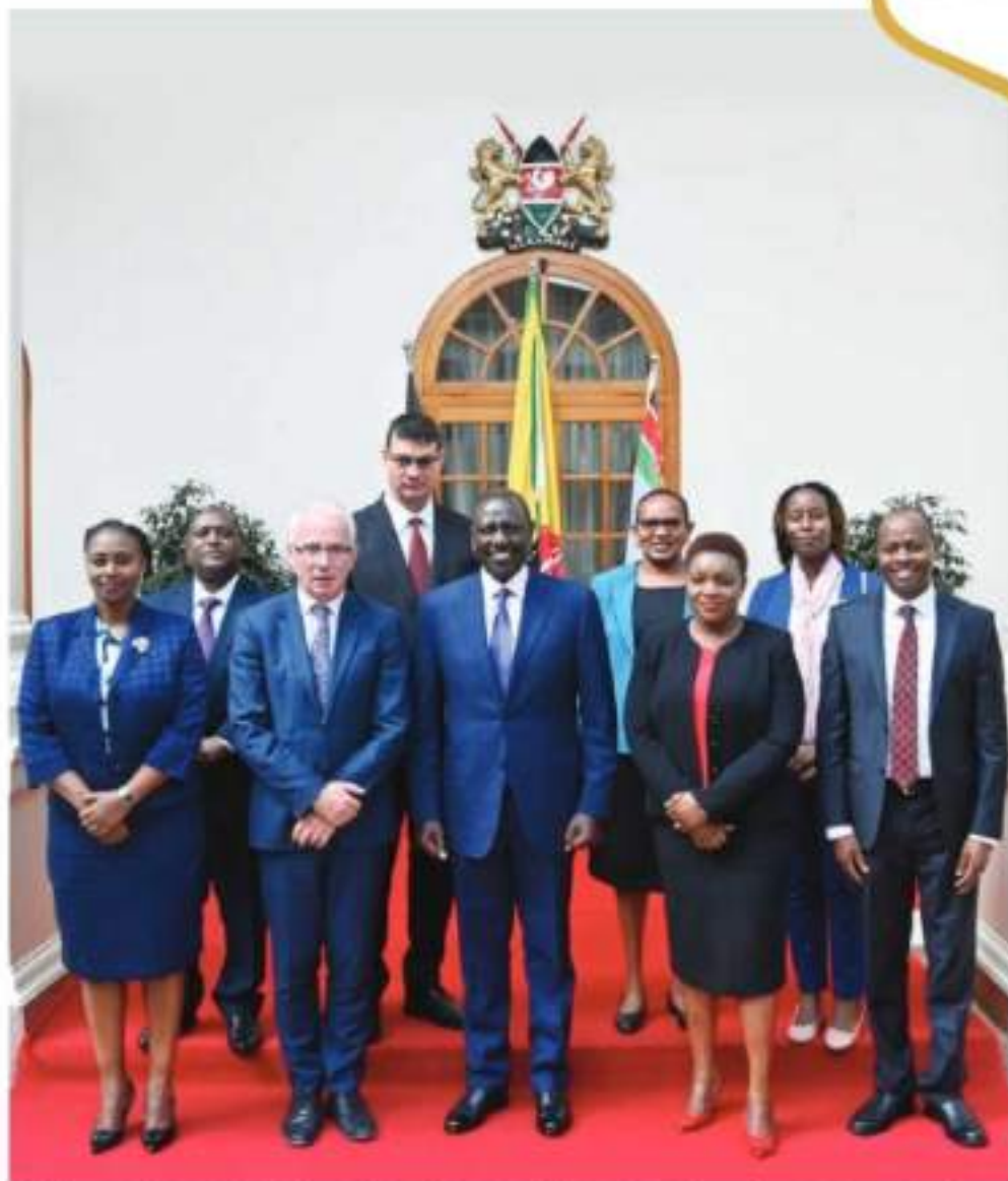
KE President William Ruto hosted Global Fund Executive Director Peter Sands. The President said that his Government has prioritised preventive and promotive healthcare. Among dignitaries present were CS for Health and KEMSA Ag. CEO