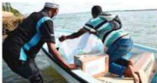
Two of the volunteers loading boxes on the boat.