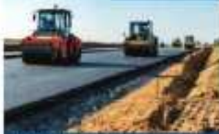
WATER, SANITATION & IRRIGATION