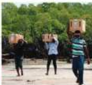
Volunteers carrying supplies to a school in the town they are visiting.