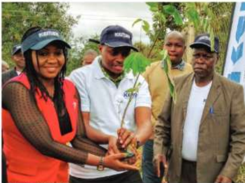
IGDP, Nairobi County and KEMSA Ag (20)