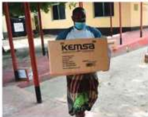
One of the consignments used to assist in the health emergency in Lere.

The dispensary is a free facility that serves not only residents of Malindi but the population of the surrounding area as well. We offer general and ambulatory care, immunization services and referrals. We serve