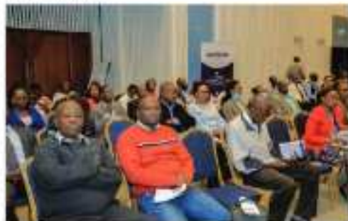
Participants at KEMSA Supply Chain Event

By adopting these measures, KEMSA expects to further interact with greater positions and diminish its previous quality of service. Essential Health Products and Technologies and supply chain solutions to save and transform lives.